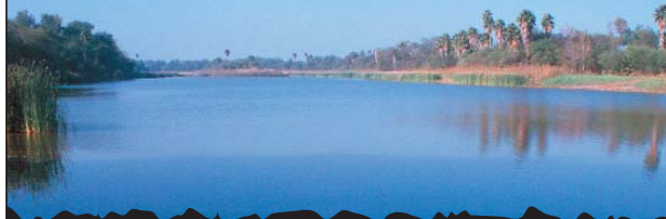
Bentsen-Rio Grande Valley SP - Mission, Texas