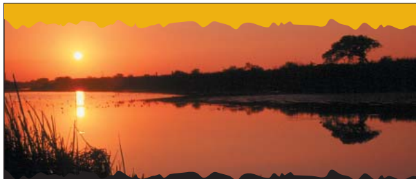
Estero Llano Grande SP - Weslaco, Texas